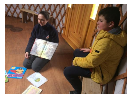
Pupils enjoying a story group in the yurt