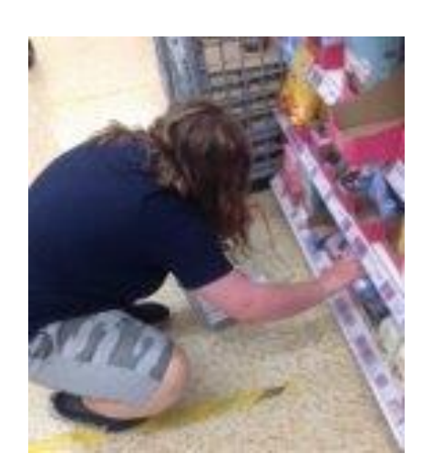
Shopping in the supermarket