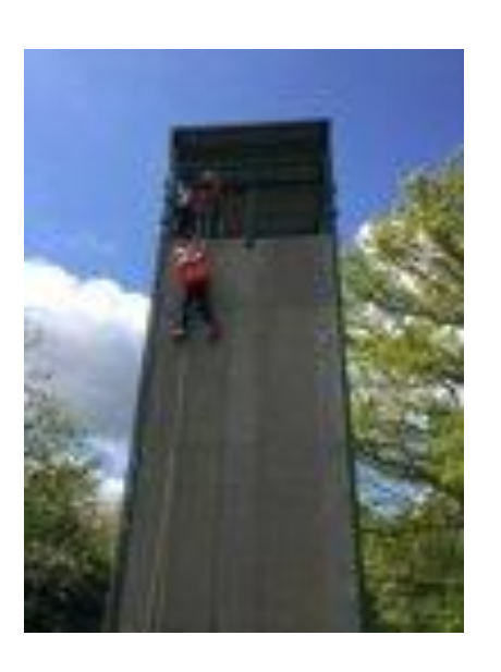
Abseiling at Blacklands Farm