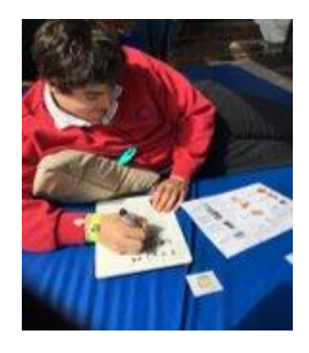
A pupil working on their shopping list

Impact – Greater confidence when out in the community, increased independence, improved life skills, money skills