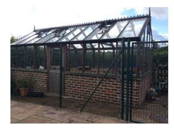
Experiencing the greenhouse